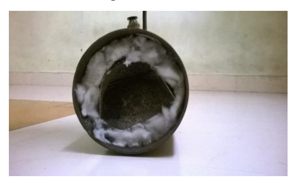
Table 1 :- Properties Of Ceramic Wool