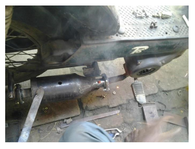
FIG 2.1. Duct Arrangement

TABLE 2 Amount of gases before using urea SCR setup