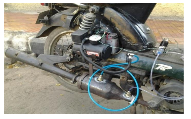
Fig 4 Full Setup