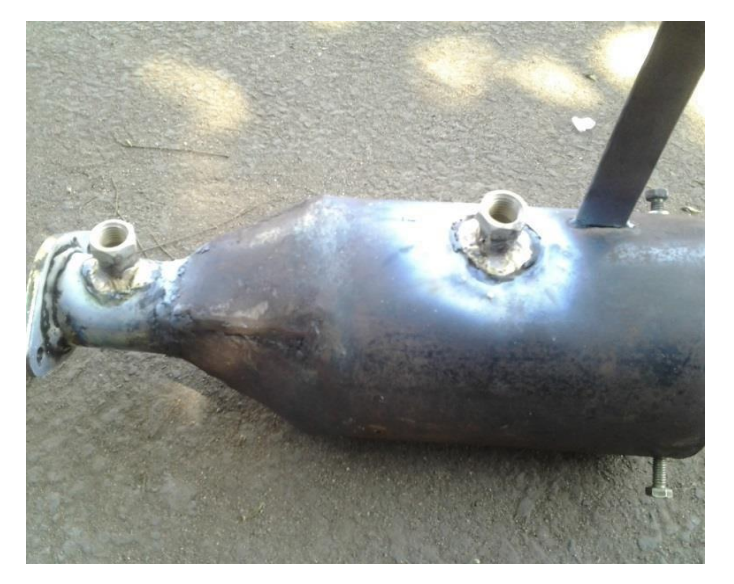
FIG 2. DUCT

size 40*40(thickness 14 mm) were used. The Porous Ceramic Filters have received particular attention when it comes to pollution abatement in automobiles. In addition to the outstanding high temperature and chemical resistance offered by the ceramics, it also offers a degree of porosity and larger surface area compared to the extruded monolithic structures. The fig2.1 shows the arrangement of the duct.