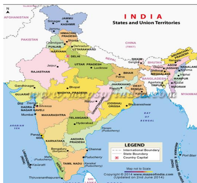
Figure AP in India

The West Godavari district is one of the 13 districts of Andhrapradesh. It occupies an area of approximately 7700 square kilometers. It has 46 Mandals out of which 24 are in the Upland Region. Geomorphologically the district can be divided into two major regions viz., alluvial deltaic region and upland areas. The deltaic region mostly constitutes black cotton soils and the upland areas are dominated by the red soils. Study area comprises of 18 panchayats in Koyyalagudem Mandal. It lies between 17.01198 to 17.1739 Latitude and 81.07491 to 81.2353 Longitudes. A systematic study is proposed to assess the quality of ground water sources.