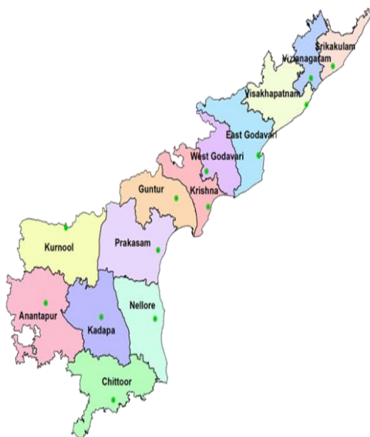
Figure 2 Districts in AP