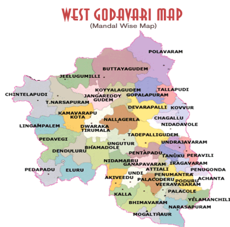
Figure 3 Mandals in West Godavari