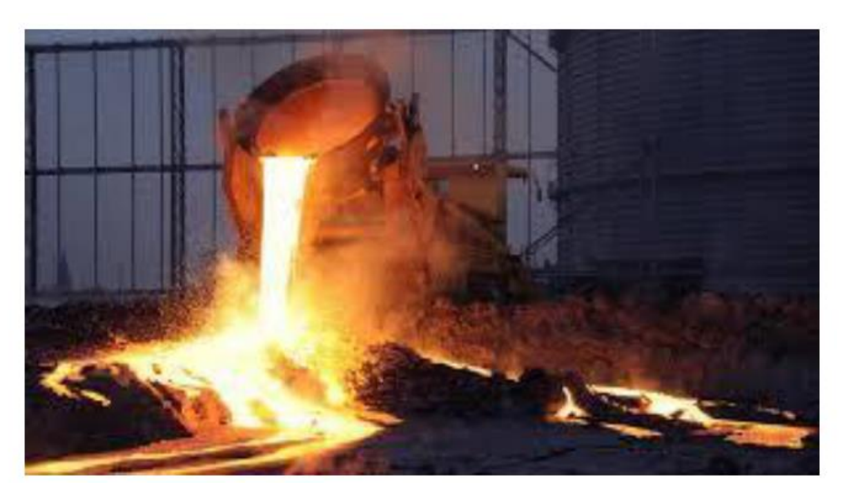
Fig. 2 Production of steel