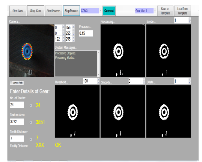
Fig 2: Non defective Gear