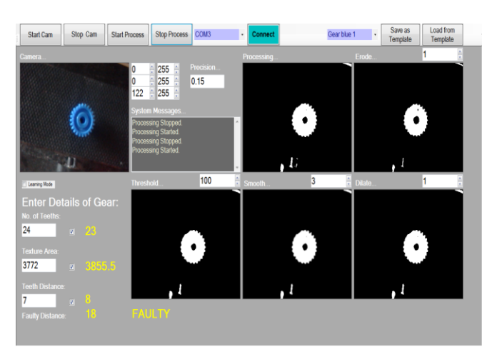
Fig 2: Broken teeth defective Gear