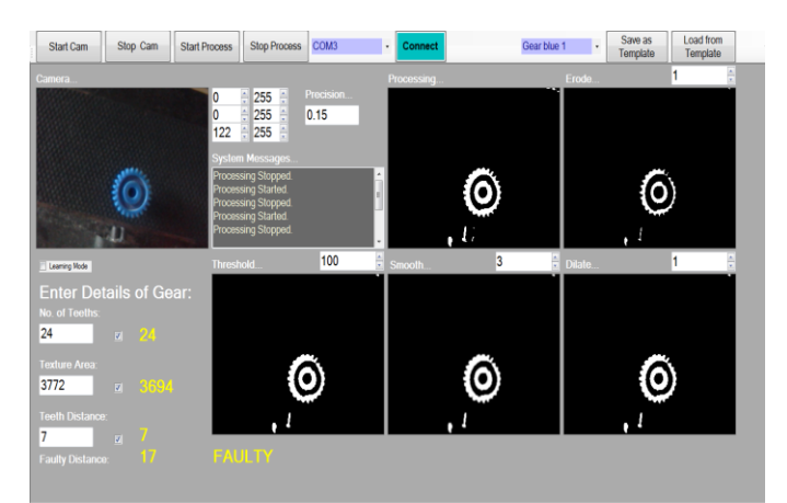
Fig 2: Texture defective Gear