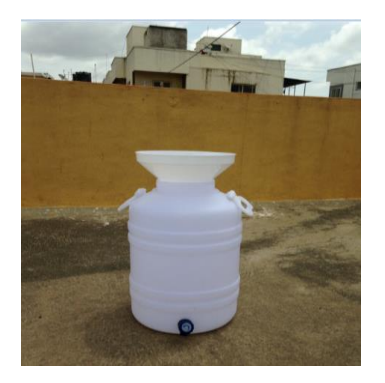
Fig. 1 Wet precipitation collector

polyethylene collector It is installed over the roof of the building as shown Fig. 1 to collect the wet- only precipitation samples in the study area. Wet precipitation is collected manually during the rain events. The wet collector is cleaned after every rain event using double distilled water.