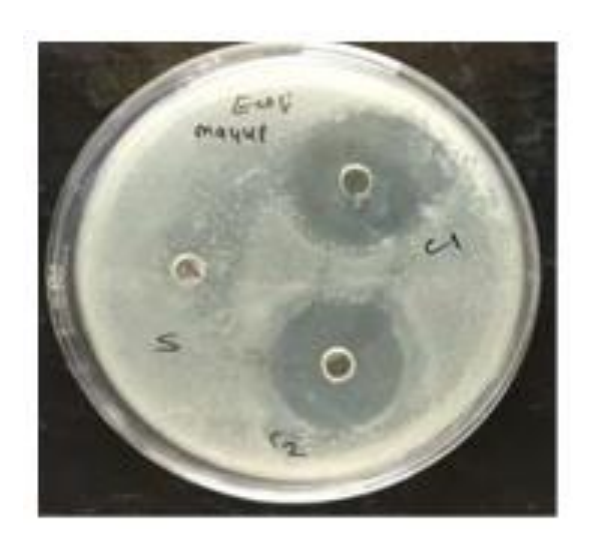
Fig. 1 Inhibition Zones (Mm) of Cefotaxim and Ceftriaxone Against E. Coli.