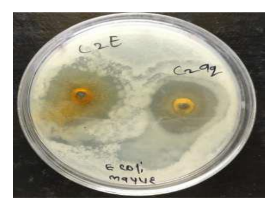
Fig.7 Evaluation of Antibacterial Activity .of aqueous and ethanolic extracts of Momordica charantia in combination with cefotaxim against E.coli

Fig. 6 Evaluation of Antibacterial Activity of Aqueous and Ethanolic Extracts of Momordica Charantia in Combination With Ceftriaxone Against S. Aureus .