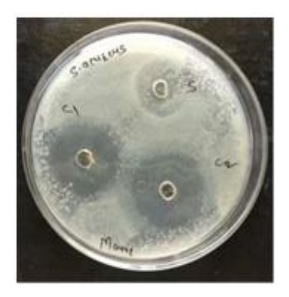
Fig.2 Inhibition Zones (Mm) of Cefotaxim and Ceftriaxone Against S. Aureus .

B. Evaluation of Momordica Charantia Plant Leaves Extracts Antibacterial Activity.