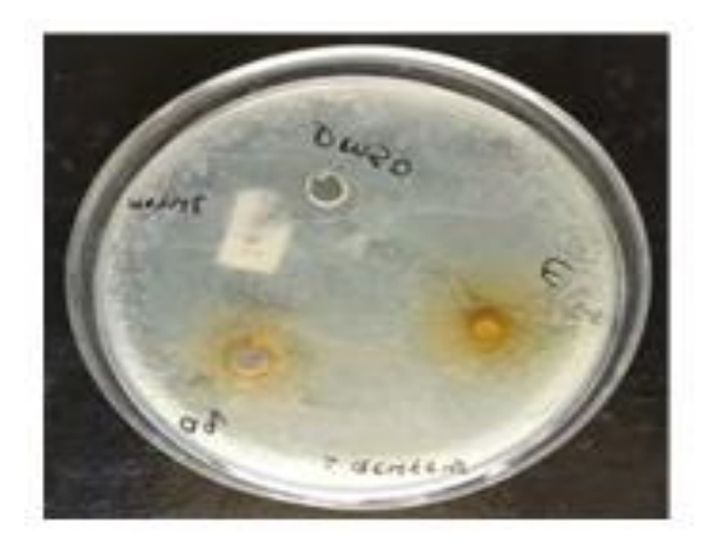
Fig.4 The Effect of Momordica Charantia Aqueous and Ethanolic Extract Against S.Aureus ..