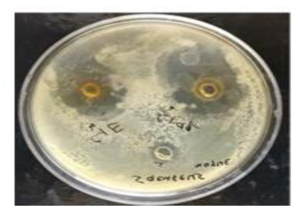
Fig. 5 Evaluation of Antibacterial Activity of Aqueous And Ethanolic Extracts of Momordica Charantia in Combination With Cefotaxim Against S. Aureus .

Table 3-Antibacterial Effect of Combination of Antibiotics With Aqueous And Ethanolic Plant Leaves Extract of Momordica Charantia Against E. Coli And S. Aureus .