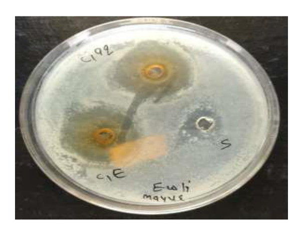
Fig.8 Evaluation of Antibacterial Activity of Aqueous and Ethanolic Extracts of Momordica Charantia in Combination With Ceftriaxone Against E.Coli.