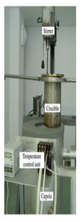
Fig.8 Specimen Preparation