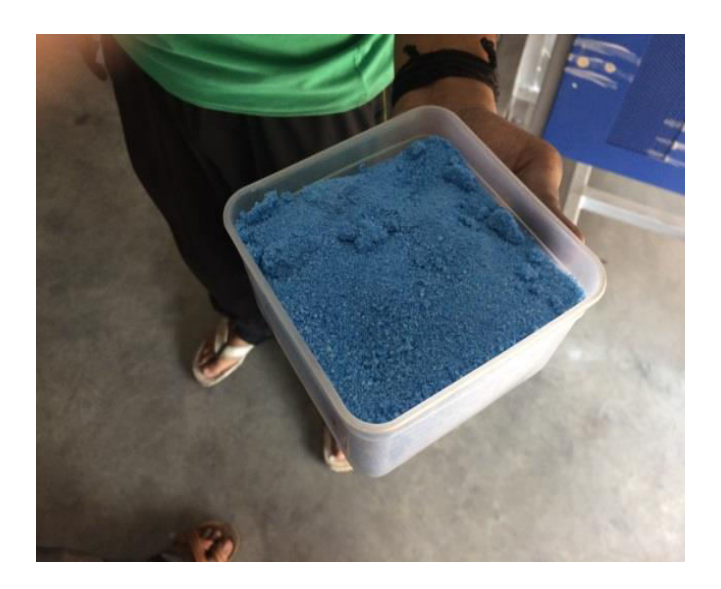
Fig.2 Die Arrangement

It is in powder form which is shown in fig.2 which is used to remove the impurities and slag and also to increase oxidation resistance. Coverall is significantly used to increase the wettability