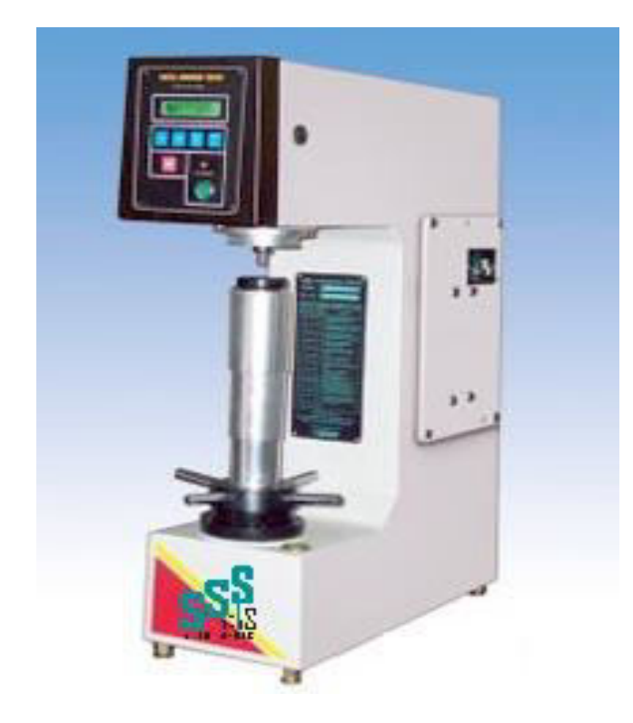
Fig.9 Rockwell Hardness Tester

Rockwell hardness testing is a general method for measuring the bulk hardness of metallic and polymer materials. Although hardness testing does not give a direct measurement of any performance properties, hardness of a material correlates directly with its strength, wear resistance, and other properties. Hardness testing is widely used for material evaluation because of its simplicity and low cost relative to direct measurement of many properties. Specifically, conversion charts from Rockwell hardness to tensile strength are available for some structural alloys, including steel and aluminum.Rockwell hardness testing which is as shown in fig.9 is an indentation testing method. The indenter is either a conical diamond (brale) or a hard steel ball. Different indenter ball diameters from 1/16 to 1/2 in. are used depending on the test scale. To start the test, the indenter is "set" into the sample at a prescribed minor load. A major load is then applied and held for a set time period. The force on the indenter is then decreased back to the minor load. The Rockwell hardness number is calculated from the depth of permanent deformation of the indenter into the sample, i.e. the difference in indenter position before and after application of the major load. The minor and major loads can be applied using dead weights or springs. The indenter position is measured using an analog dial indicator or an electronic device with digital readout.