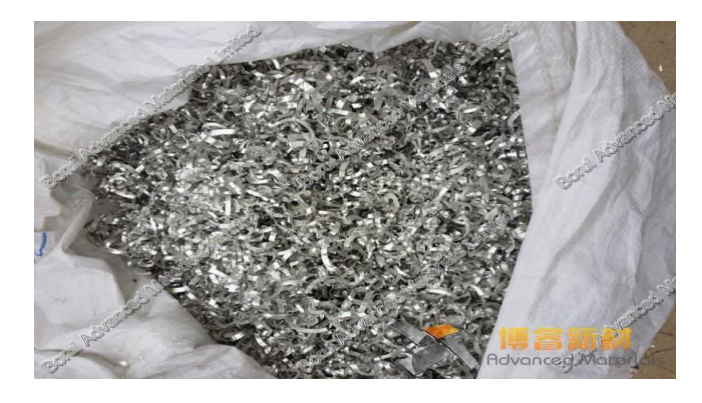
Fig.3 Magnesium chips

It is in crystal form which is normally used to increase the wet ability. If magnesium content increases more than 0.5% porosity will form, magnesium chips is as shown in fig.3