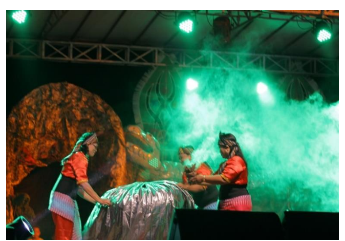
Fig 6:- Sintren as the initial scene of the palace play, Mountain Kromong Festival