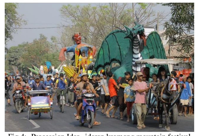
Fig 4:- Procession Ider –ideran kromong mountain festival