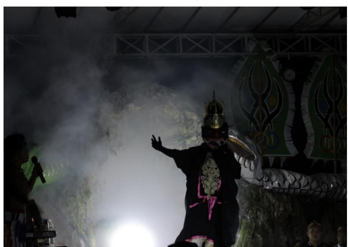
Fig 8:- The Scene of Play Cave Palace Festival of Mountain Kromong

E. Glorification of the Natural, Social, Economic, and Cultural Arts Environment