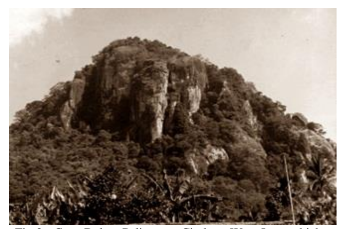
Fig 2:- Cave Dalem Palimanan Cirebon, West Java, which until now still stands as part of the Cirebon kromong mountain cluster (source; Researcher)

for the benefit of industry, such as the natural andesite stone and lime stone.