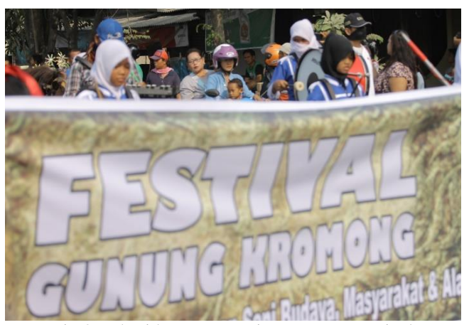
Fig 3:- Ider-ideran Mountain Kromong Festival

The cultural march took place from 07.30 until 10:00 am until it entered the Palimanan mountain kromong festival area. This cultural march was enough to attract the attention of the community along the parade location road filled with local residents, from children to adults. This cultural parade also had a traffic jam of around 1.5 hours, but nothing happened to disrupt the social life of the people of the area, even becoming a unique sight so far. The following is a picture / photo of the ider-ideran activities in the Mount Kromong festival.