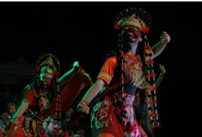
Fig 7:- Palimanan Mask as Part of the Palace Play Scene, Kromong Mountain Festival