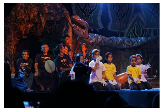
Fig 5:- Rudiment Genjring as a Welcome Presentation at the Mountain Kromong Festival (source; Researcher)

In the evening, the Mountain Kromong festival starts from 08:00 to 11:00 pm with the main show being Mountain Kromong Performing Art . The Mountain Kromong Performing Art involved 60 artists and was supported by the committee of the Mountain Kromong festival by involving residents of 3 villages of 40 people. The show begins with the opening music of the Mountain Kromong Festival which features the Kromong Genjring and is accompanied by a children's rudat dance, as part of the process of welcoming the public to come to visit the festival.