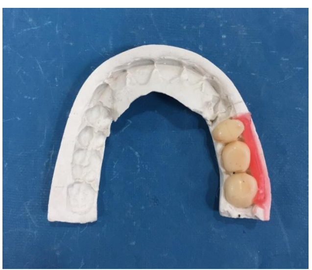
Fig 5:- Teeth Placed in the Index and Secured with a Thin Strip of Wax to Prevent them from Falling when Inverted

Then teeth are placed in the mold which can be secured with a thin strip of wax.