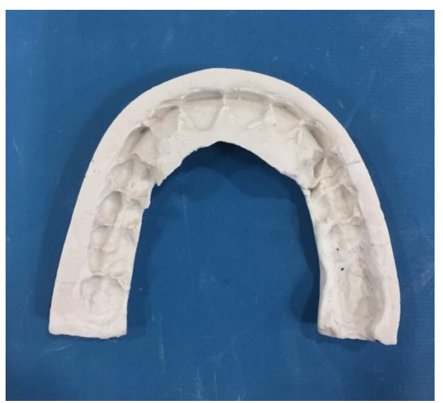
Fig 3:- Plaster Index

Plaster is mixed in thin consistency and applied on to the occlusal surfaces and thickness is kept to 1 cm and plaster index is flattened and finished with sand paper to remove the roughness. Plaster index is removed once it sets. The posterior over extension at the II molar area is shortened with a model trimmer. Plaster index is retrieved.