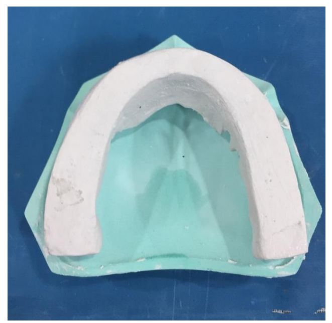
Fig 4:- Index Places on the Ridge to Check for Suitability

Plaster index is placed on the primary cast and is assessed for suitability.