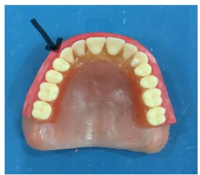
Fig 1:- Wax Strip- 3mm Breadt

Ideal Class I casts are lab mounted on Hanau H articulator with a mounting Jig. Teeth arrangement was done for class I relationship. A wax strip is melted and placed around the buccal surfaces of the teeth at the level of middle third. Modelling wax is used to make this wax extension. Thickness of the wax strip is 3 mm. The breath is about 4 mm and it is extended till the last teeth.