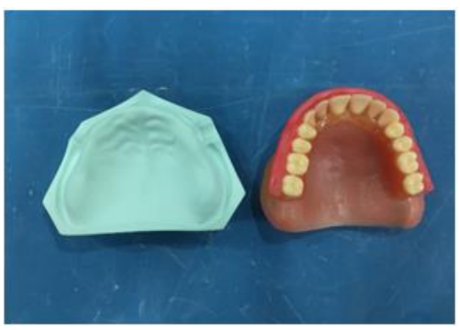
Fig 2:- Ideal Cast and Wax Up

A thin coat of Vaseline is coated on to the surfaces of the teeth to aid in easy separation of the index.