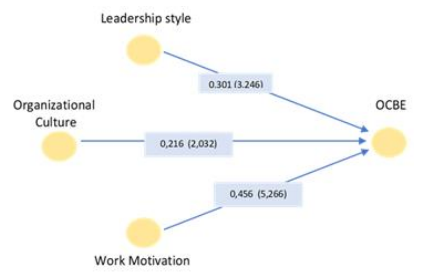
Fig 3:- Coefficient of t Model Data processed by Author (2019)

The Figure 3 shows that the leadership style has a positive influence on OCBE because it has t_{value} (3.246)> t_{table} (1.99) and the influence is 30.1%. Organizational