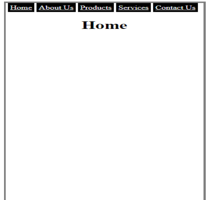
Fig 3:- Horizontal text menu

1 tap to go to menu and another tap to finally navigate to page required.