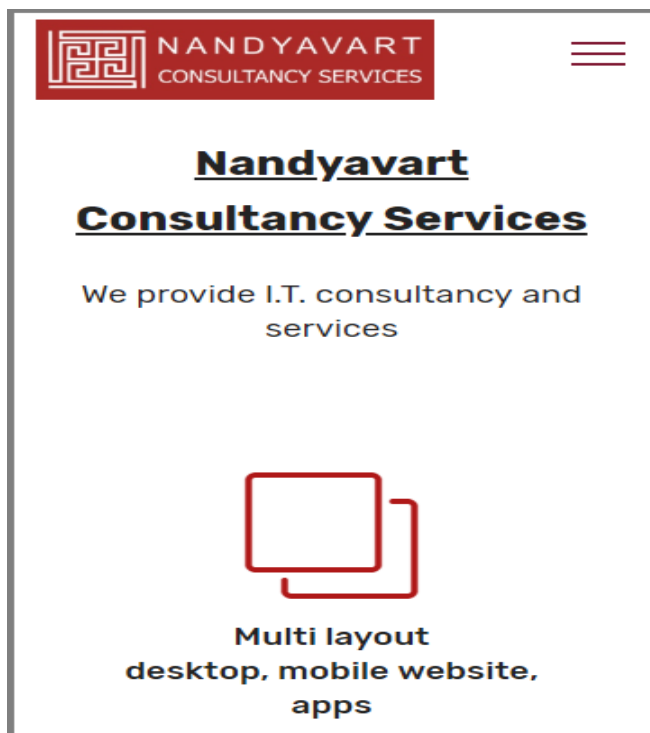
Fig 2:- Hamburger on top right

First Infographics based menu is shown below. Consideration is that it is less understood and takes more space. Limited number of infographics can be shown. Single tap would be sufficient to take the user to the desired page offered on the website.