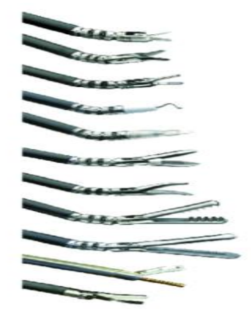
Fig 4:- da Vinci instruments. The 7 degrees of freedom reproduce those of the human upper limb.