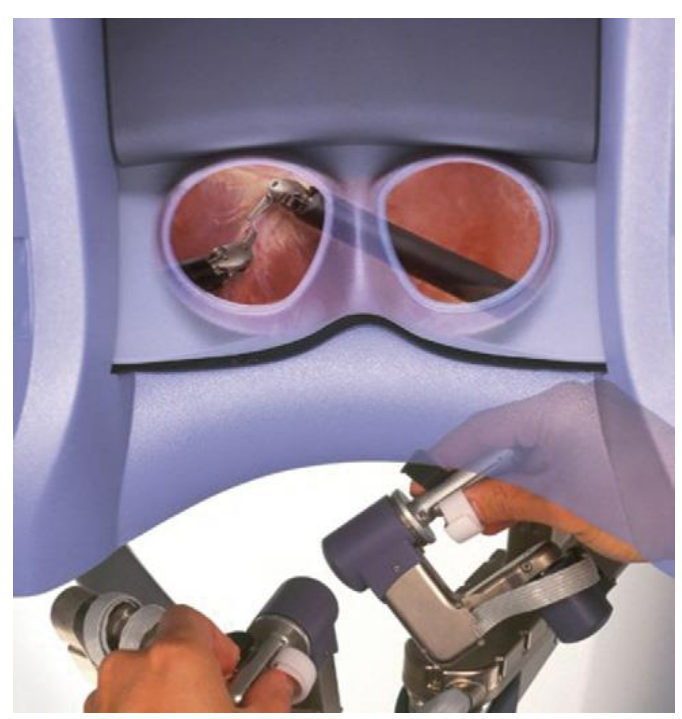
Fig 2 :- da Vinci Vision System. Two tri-CCD cameras provide real 3D vision. The hands are in the.

Fig 1:- da Vinci Control Panel. The surgeon is comfortably installed, arms supported and eyes "immersed" in the operating field.