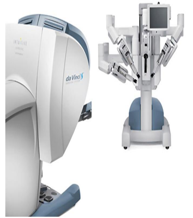
Fig 3:- da Vinci Robot "S" with four arms. Latest product from Intuitive Surgical, sold for 1,400,000 euros.

It is therefore logical that the potential benefits of robotically assisted surgery should be reserved for technically difficult procedures or those taking place in limited spaces. The procedure that has benefited most from this technological advance is radical prostatectomy. Current data in the literature are consistent and report simpler postoperative outcomes, oncologically adequate resection margins, and results in terms of sexual or urinary function superior to those obtained with either open surgery or conventional laparoscopic surgery.