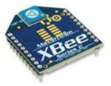
Fig 3:- Xbee module

The XBee module is a small radio modem operating on the principle of 802.15.4 and/or ZigBee standards. It is an electronic circuit capable of transmitting and receiving data by RF transmission. It has different communication modes and some electrical functions allowing it to perform tasks usually dedicated to a microcontroller.