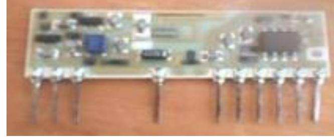
Fig 4:- 433.92 MHZ receiver module

The Aurel 433.92 module is a radio equipment consisting of a transmitter and a receiver that can communicate with each other. This module, connected to an external antenna, allows the transmission of HiFi signals, radio alert signals or remote-control signals in DTMF.