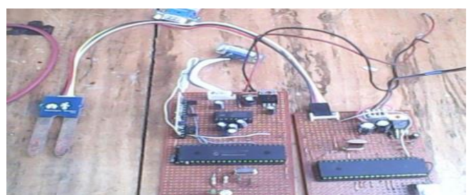
Fig 7:- Final assembly of componentsIts technical characteristics are as follows:Transmission frequency: 433.92Output: 5V / DCMHZPower supply: 2.4 kbit/sBandwidth: ±2000KHZSensitivity :100 dBmConsumption :2.5 MaConsumption :2.5 Ma