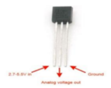
Fig 2:- Ground temperature sensor

Powered with VCC, GND and center pin to one analog input. The signal conversion, one (1) volt corresponds to 100 degrees Celsius (ground temperature) and the reading of the signal from 0 to 5V is coded from 0 to 1023 hence the formula Time = volt *5. /1023*100