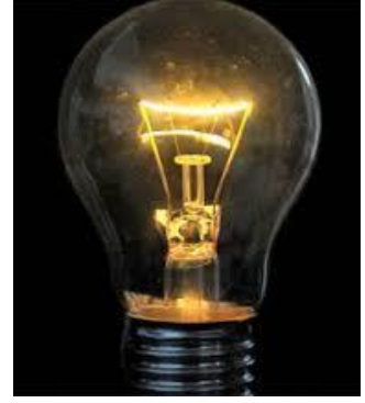
Fig 2:- Fluorescent Lamps

Light is produced by the filament of the tungsten material (melting point > 2200 \degree c) which is glowing due to heat. This lamp efficacy is low, only 8-10% of energy becomes light. The rest is wasted as hot. In general the lamp.