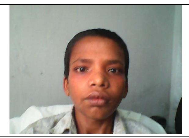
After ice pack application