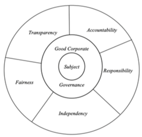
Fig 1:- Framework Good Corporate Governance

According to the KNKG (2006), in good corporate governance, five principles must be applied by both government and corporate governance institutions, namely transparency, accountability, responsibility, independence, fairness, or equality. The five principles are needed to help the company to achieve its objectives. The five principles are defined as follows: