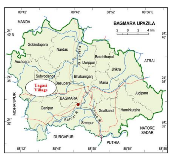
Fig 1:- Map of Bagmara upozila, Rajshahi and the study area is the Tagasi village of Suvodanga UP.

The locale of the study area is indicated in the following map of Bagmara upozila.