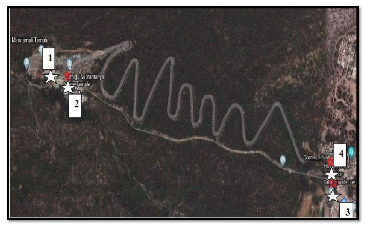
Fig 1:- Location of Air Sampling Sites