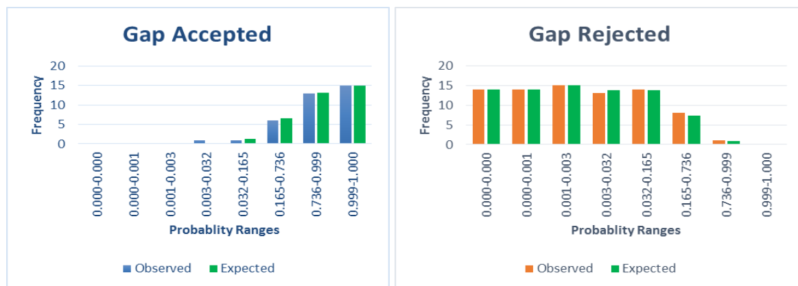
Figure 4. Observed and Expected Frequencies for Right turning.

gap acceptance probability has been divided into ten groups and evaluated for rejected and accepted gap separately. Observed probability expected are compared for each ten groups.