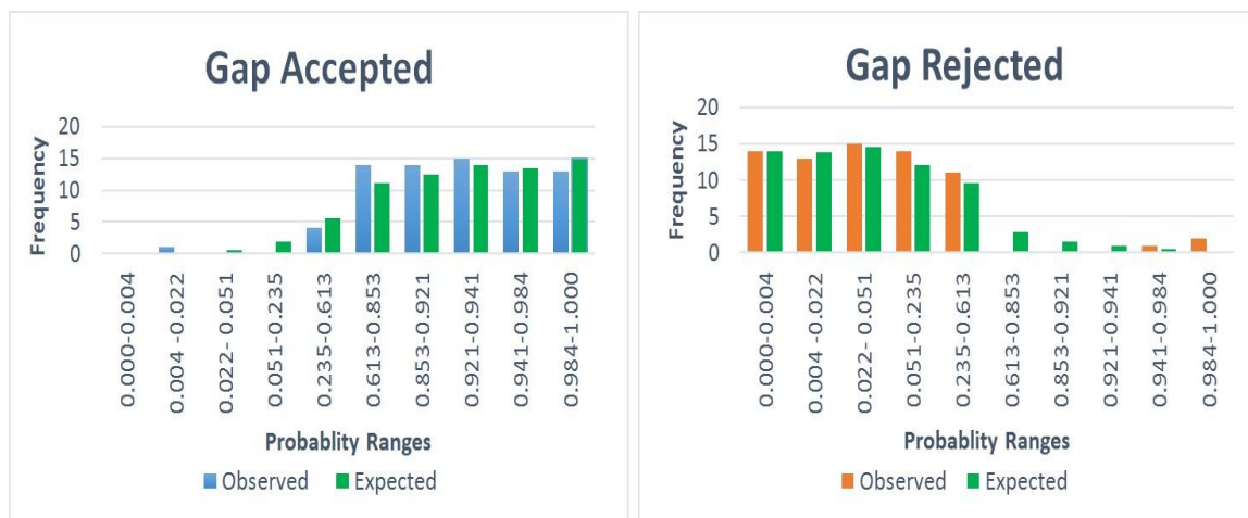
Figure 3. Observed and Expected Frequencies for Left Turning.

well the model fits the data. The goodness-of-fit tests to determine whether the predicted probabilities deviate from the observed probabilities. for the deviation.