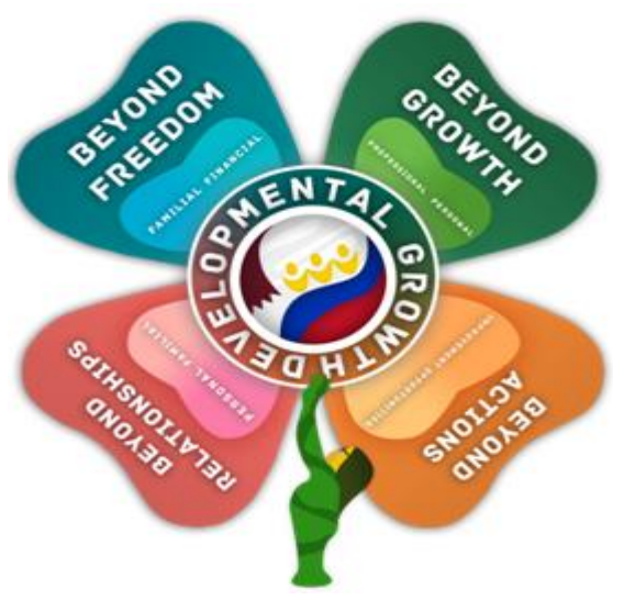
Figure 3 Simulacrum

showcases love and nature, and it is the color for comfort and compassion. For the stem, drawing into a teacher, located at the bottom, represents how a teacher carries all these responsibilities and how it affects their developmental growth.