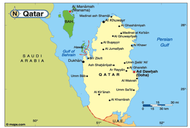
Figure 1: Map of Qatar

The study was conducted at the Philippine School Doha (PSD), founded in October 1992 in the State of Qatar.