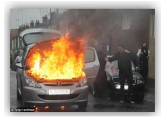
Fig 6:- Car on fire[16]

From this picture, it is clear that the fire is at such height that normal extinguishers can do nothing. And if someone has to extinguish this fire then s/he have to risk their life by entering thisburning building. But by throwing a few Foam grenades from the window fire can easily extinguish.