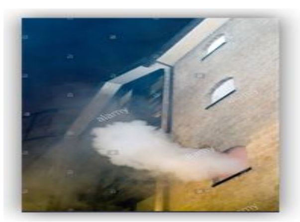
Fig 5:- 1<sup>st</sup> floor fire [15]

Fires involved in buildings above ground floor posses height, that pressure in normal fire extinguisher can not expel the charge to fire site. Hence the fire remails expanding. But if someone uses a Foam grenade instead, the small fires will extinguish rapidly. One example of such a situation is shown in Figure 5.