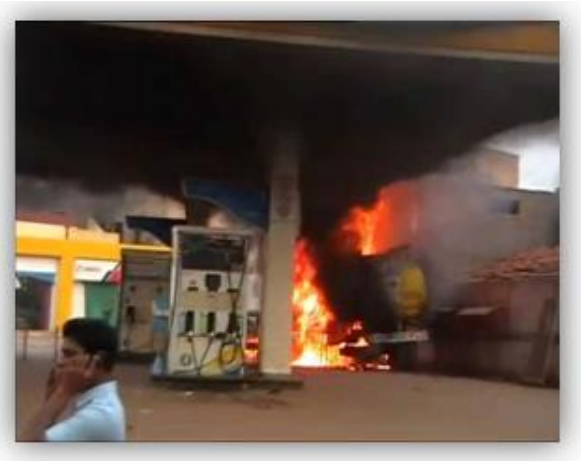
Fig 4:- Tank fire at petrol pump station [14]

One example of such a situation is shown in figure 4.