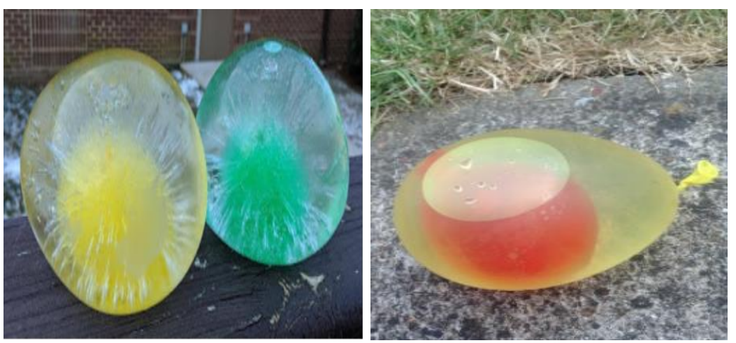
Fig 1&2:- Foam Grenade's 2 layered structure [12] [13]

A figure for understanding how the Foam Grenade looks like is shown in figure 1 & 2 (not the actual device)