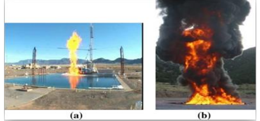
Fig 7:- Pool Fire[17]