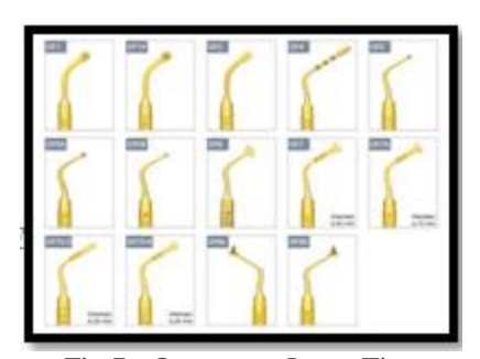
Fig 7:- Osteotomy Insert Tips

piezosurgical device is used widely in the osteoplasty and ostectomy procedures. The morphological characteristics of the ostectomy and osteoplasty is mainly depending on the tips and unit used in that procedure. <sup>[4]</sup>