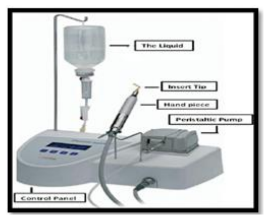
Fig 2:- Piezosurgery Unit

The device unit is composed of main body and holder for handpiece, inserts and irrigating coolant fluids