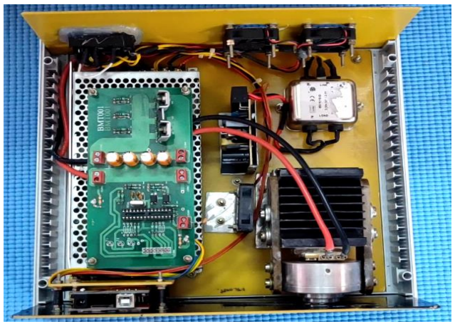
Fig 2:- Project Image

The working of the proposed project deals a lot of various topics . Let us put forth a bird eye view model of the project model and implementation. The constant power supply is used for equipment, Two SMPS (Switch Mode Power Supply) one is 5V 2AMP & 5V 25AMP the first one is connect to the Arduino Uno which Arduino Uno need working voltage is 5V 2AMP and second one is used for the Luminous LED actually Luminous LED required 4V 2AMP by doing small changes in second SMPS that produce 4V 2AMP. By using touch screen display we can increase or decrease light intensity based on that Arduino Uno which have microcontroller ATMEGA 328P IC generate PWM (Pulse Width Modulation). If light is increase to 10 percent, then PWM ON 10 percent and OFF 90 percent similarly if it is increases to 20 percent the it ON 20 percent and OFF 80 percent in simple word 5Voltage is same in SMPS but current is increase from 0 to 25AMP, so that light intensity will increase. The changeable adapter is used for multiple surgeries and due to increasing intensity of LED the heat is generated in heat sink and also voltage fluctuation occurs so that we use RF filter is used to control and cooling fans are used to exhaust the heat from the equipment.