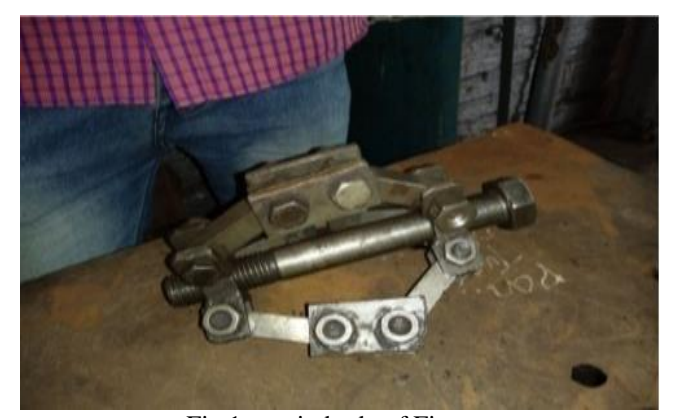
Fig 1:- main body of Fixture