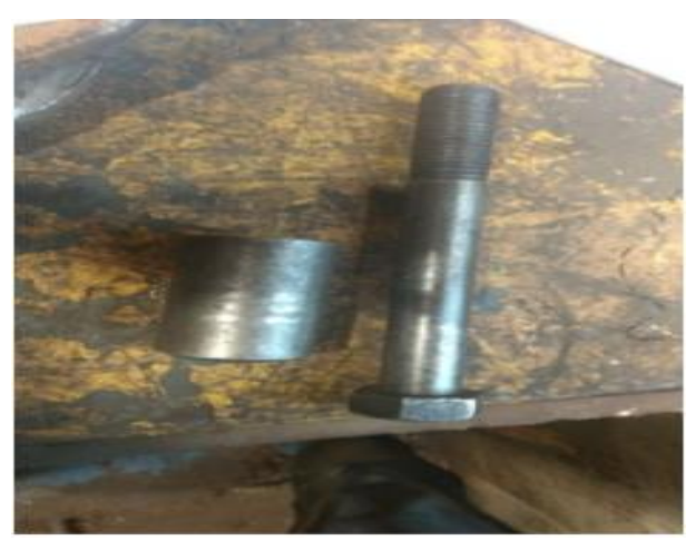
Fig 2- stud and spacer