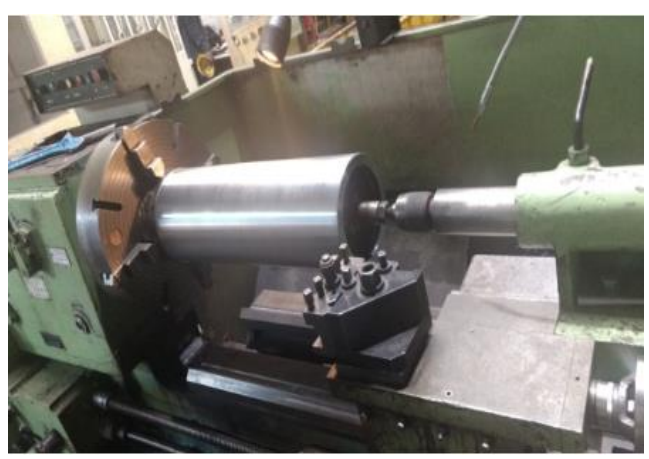
Fig 4- Turning & facing operation