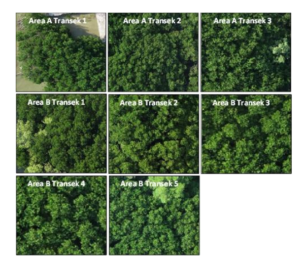
Fig. 1. Transect Plot Aerial Photography Fig. 2.

Other types of animals found in the Pandansari mangrove area are gelodok fish, crabs, and mussels. Based on these data, it can be determined that the average weight value for each animal species in the research transect in the Pulau Lumpur area is 11.88 (Figure 2).