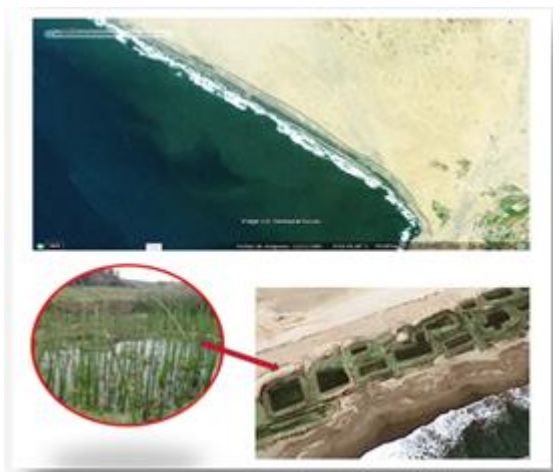
Figure 3. View of the wetlands ecosystem ("totorales") of Huanchaco without occupation of territory, year 1969.

3- Spatial transformations of the wetland ecosystem environment : The occupation of the territory that has meant the reduction of the wetland ecosystem (Figures 5 and 6), to the point of placing it in a space at critical levels. The wetland ecosystem has not only been not conserved and protected, but it is threatened and fenced off by changes in land use, including cliffs.