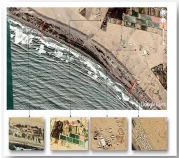
Figure 4. View of the environment of the Huanchaco wetlands ecosystem ("totorales") where the occupation of the territory is observed, year 2020.