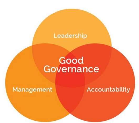
Good Governance in an orginisation.

Its seem today that in intercontinental expansion, good governance is a way of measuring how public organizations conduct public affairs and manage public resources in a preferred way.