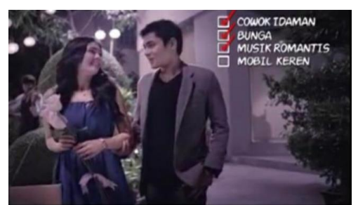
Fig. 4. Scene 3: Romantic Music

Thus, the rosebond can be translated analytically, if not empirically, into a marker, a rose, a marker of desire, and a sign that combines and is inseparable from these two components, the rose as a sign of desire. Here desire is a process of signification. The fact that this gluing of meaning, the rose signifies desire. in a color that has its own meaning in color.