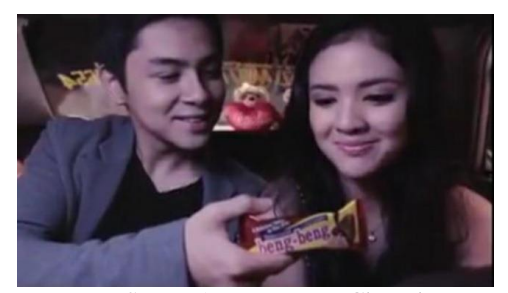
Fig. 6. Scene 5: Beng-Beng Chocolate

But to value hedonism appropriately, we need to note that most hedonist philosophies do not recommend that we just follow all the impulses of lust, but so that we fulfill our desires that result in the pleasure of being wise and balanced and always able to control ourselves, there is an agreement to use the power of identity which has always been the virtue of the ability of the bourgeoisie to increase value.