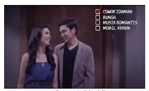
Fig. 2. Scene 1: Ideal Boy

Based on the results of the analysis of the "Great Date" version of Beng-Beng advertising using the Barthes analysis model approach, it can be explained based on the analysis model by looking at the denotative and connotative meaning. Looking at scenes 2 to 4, there are 5 items that form the outline of the text that reinforce the purpose of describing advertisements, including how women in advertisements are depicted. The five items include: "Dream Boy, Flowers, Romantic Music, Cool Cars, and chocolates." Of these five items are signs that are used to strengthen the ad text and describe the situation in a strong and comprehensive manner in the ad.