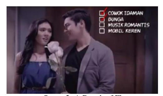
Fig. 3. Scene 2: A Bunch of Flowers

In advertising, it is often described as a dominating position. This has become a criticism for the view of feminism because it puts men in a position that is not marginalized or discriminates against in the position of advertising content. In this advertisement, men are not positioned as masculinity, but men are positioned as positions that strengthen the role of women.