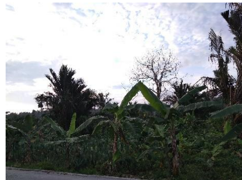
Figure 3. The natural environment of Muntei Village

The natural environment of Muntei Village is beautiful, the area is overgrown with plants. Most of tourists search for the environmental picturesque [10], [5]. The photograph of Muntei Village can be seen in Figure 3.