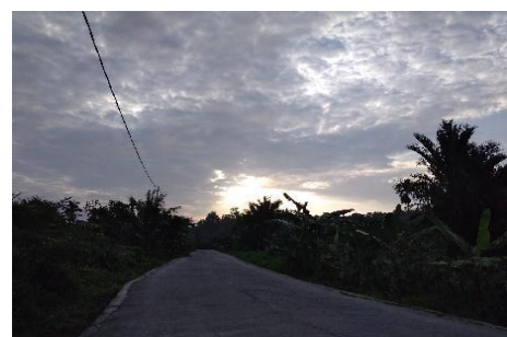
Figure 4. There are no food stalls along the way of Muntei Village

Food stalls are not yet available in Muntei Village. Figure 4 shows the atmosphere along the road where there are no food stalls visible. It is a weakness [12].