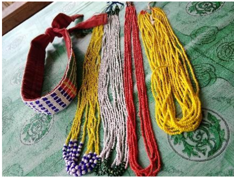
Figure 5. Handicrafts in Muntei Village

The typical food of Muntei Village is Subbet and Sago. However, there is no community that sells both types of food. The sign of the existence of Muntei Village is marked by the Village Gate. In addition, even villages are equipped with street names and directions to certain locations. There is no map of the location of the village to make it easier for tourists to reach the village. For the food and the direction, they are weaknesses [12].