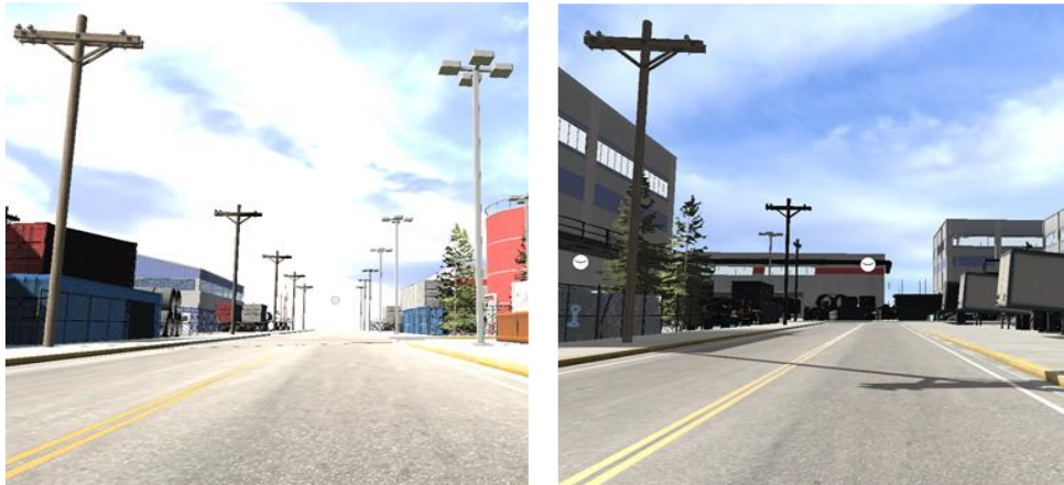
(a) Intelligent agent's perspective (b) Navigation target Fig. 2 Image information in virtual scene simulation

agent receives information about the screen pixels that can be seen from its viewpoint (Fig. 2 a) as well as the navigation target image information (Fig. 2 b) and outputs the probability of the intelligent agent executing different action strategies such as forward and backward. The action selection strategy of the intelligent agent at discrete time point t is to select the action in the strategy space that has the highest probability of obtaining the optimal evaluation value at the moment t+1 .