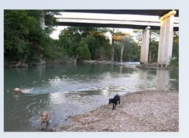
Caption: Dog is running through the water

Automatic Image Caption Generation System