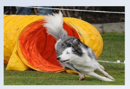
Caption: Dog is running through the grass.