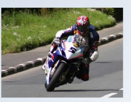
Caption: Man in red shirt rides bike on the street.

We did find a precision of 63% from our observation which was better than other dataset which was used before it.