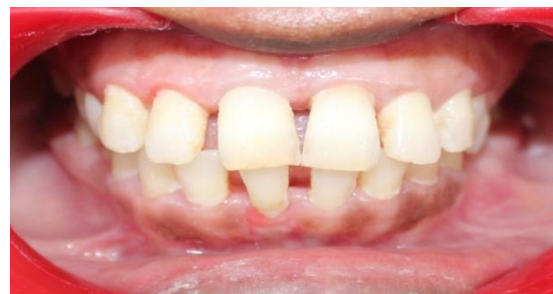
Fig.5: Immediate Post operative picture