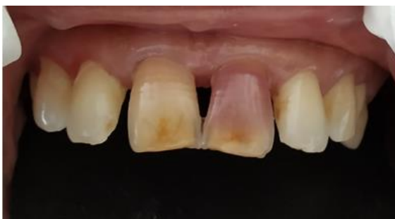
Fig. 1: Preoperative Picture