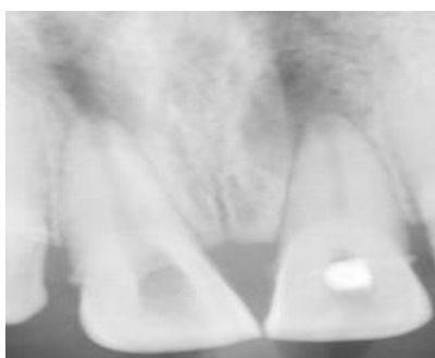
Fig. 2: Preoperative radiograph