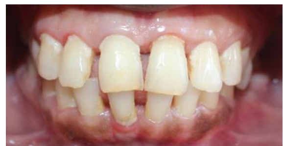
Fig.6: 18 months review