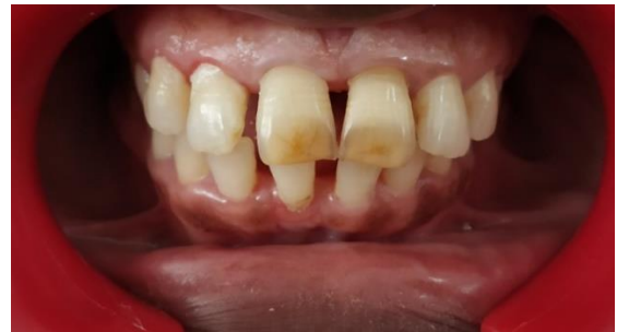
Fig.4: After walking bleach