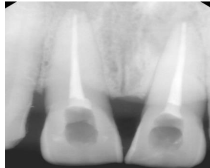
Fig.3: GIC barrier placed in skyslope appearance

She was recalled two weeks after obturation for bleaching. The coronal Gutta Percha was removed up to 2mm below the cervical margin and GIC barrier was placed in sky slope appearance (fig.3). Sodium perborate mixed with distilled water was placed in the pulp chamber and restored temporarily with intermediate restorative material (IRM) for two weeks (Walking bleach technique). Patient was recalled after two weeks and change in shade was noted. Walking bleach technique was repeated and patient was reviewed two weeks later. Considerable change in shade was noted at cervical and middle thirds but not in the incisal thirds(fig.4) in both the teeth. In office Power bleaching was done on the incisal third using 30% H 2 O 2 ('DASH- In office teeth whitening system'-Philips, USA). Patient was reviewed two weeks later and shade of bleached teeth were matching with adjacent teeth(fig.5). Post endodontic restoration was done using composite in both teeth. Patient was reviewed at 3 months and 18 months(fig.6&7) showed good periapical healing and color stability.