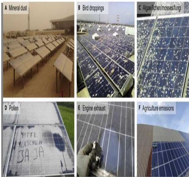
Fig. 2: Various methods of soiling

of soiling (like residue and snow) and the recurrence of cleaning times. Dust saved on the light-receiving surface of the module will initially decrease the light conveyance of the module surface. Then, at that point, besides, it will change the occurrence point of a piece of the light, making the light spread unevenly in the glass cover. Studies have shown that under similar conditions, the resulted power of a clean sunlight-based module is basically 5% higher than that of a residue gathering module. We can say that higher the residue collection, the more prominent the lessening in the result performance of the module.[10]