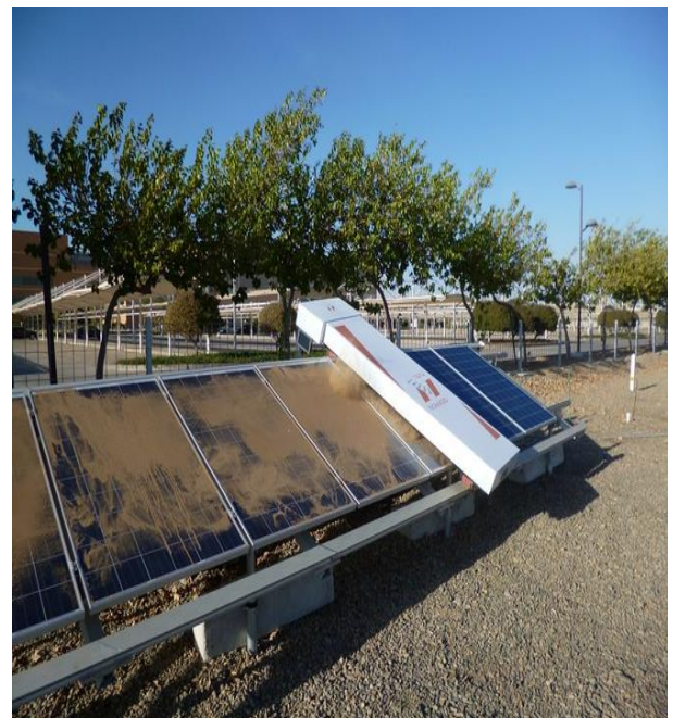
Fig. 7: Cleaning of Solar Panels by a Rugged Robot

Deserts are ideal for extracting maximum energy due to the abundance and high intensity of sunlight that falls on the surface. Hence solar panels placed here can be highly efficient. Despite the benefits, there are a lot of factors that affect the energy generation. The most common being the dust. The dust flowing in the desert can easily cover the panel, hence hindering with proper energy generation. Sending labour to clean it will be extremely hazardous, as the temperature around the panels can go upto 122 degrees Celsius. Hence, rugged robots are employed to do the same. They are placed in conjunction to the panel, and they move along the surface of the panel at regular intervals. This ensures that the panel gets cleaned of any dust that gets accumulated in between the cleaning cycle of the robot.[1]