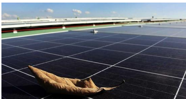
Fig. 3: Shading of Solar Panel

As we knew, shading is the obstruction of irradiance due to trees, buildings, terrain, and other objects in the environment. The effect of shading on the power output of a solar installation is highly inconsistent. For example, when one solar pallet in a solar panel is shaded, all the preceding un-shaded cells can dump their corresponding energies into the first shaded cell as heat. This creates a hot spot that can potentially damage the solar panel if it lasts for a long time.[8][10]