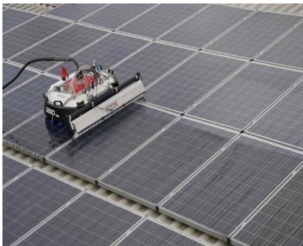
Fig. 7: Cleaning of Solar Panels by Robotic Vacuum Cleaner

This framework is implemented utilizing two subsystems specifically a Robotic Vacuum Cleaner and a Docking Station. The robot uses a brush and a suction technique to clean the panel.. The brush moves in such a way that the dust is directed towards the suction pump. The motors rotate at very high speed, hence sucking the dust from the panel. This robot uses a combination of sensors to move around the panels to clean it. It is fabricated so as to work in slippery and tilted surfaces. Some feedback systems are used to decide the path that the robot must traverse.. The battery status of the robot is continuously monitored. When it goes below the minimum level, the robot is programmed to go back to a docking station, where it gets recharged and then is again sent for cleaning..[1]