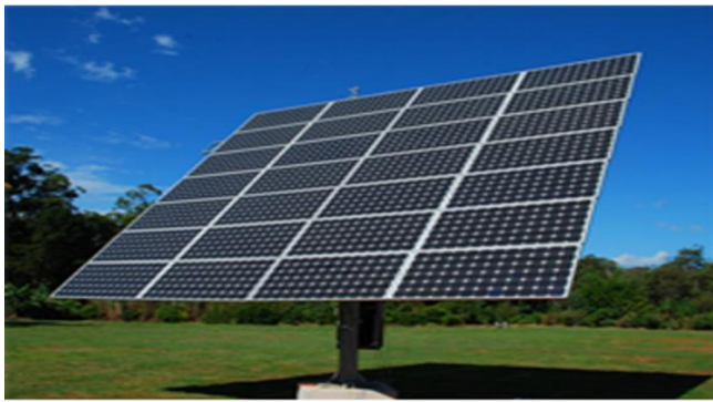
Fig. 5: Sun tracking Solar Panel