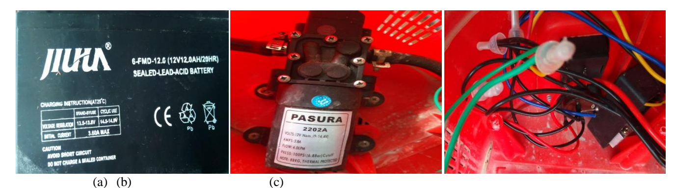
Fig.2: (a) Battery, (b) Pump, (c) Interconnections

proposed system saves the former costs by not using the fuels for operation and helps the environment from harmful gases. Figure 2 displays the battery, pump, and interconnections used in the proposed system. Figure 3 depicts the overall proposed system. Table 3 gives the cost of different components used in the proposed system.