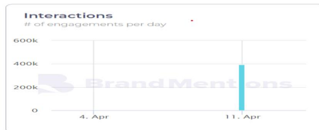
Fig. 1: Social Media Engagements on University of Columbia Social Media Site

engagements on HEI’s Social Media pages including mentions. In comparison to the University of Columbia in the USA the levels of engagements in Figure 1 below are higher than accumulated levels of engagements for HEIs in Table 2. The role of interaction on Social Media platforms is to increase value and create brand visibility (Hamilton et al. , 2022).