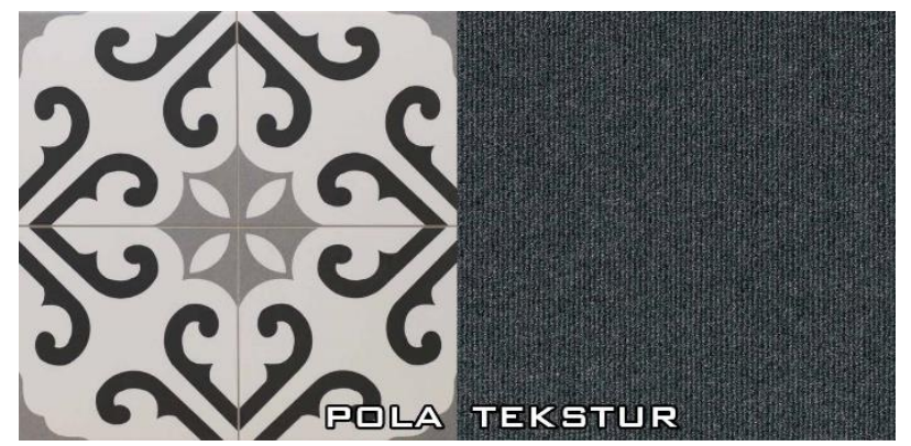
Fig. 1: Differences in Patterns and Textures in Design

furniture, carpets and various other surfaces.