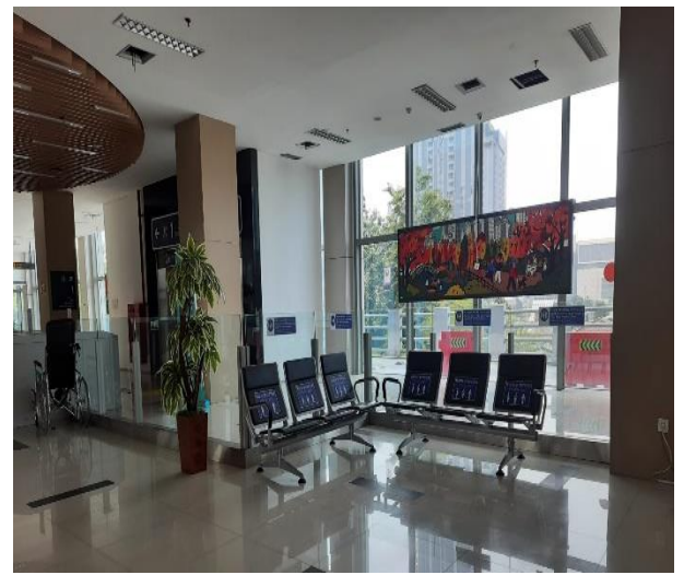
Fig. 8: Colorful Paintings in the Inner Room of the BNI City Station Building