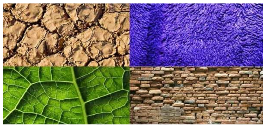
Fig. 2: Examples of Textures on the Surface of Objects

Examples of textures in the inner space are rough, smooth, gauze, slippery, hard, soft, patterned, plain, brilliant, gloomy surfaces, and others that are applied to floors, furniture, carpets and various other surfaces.