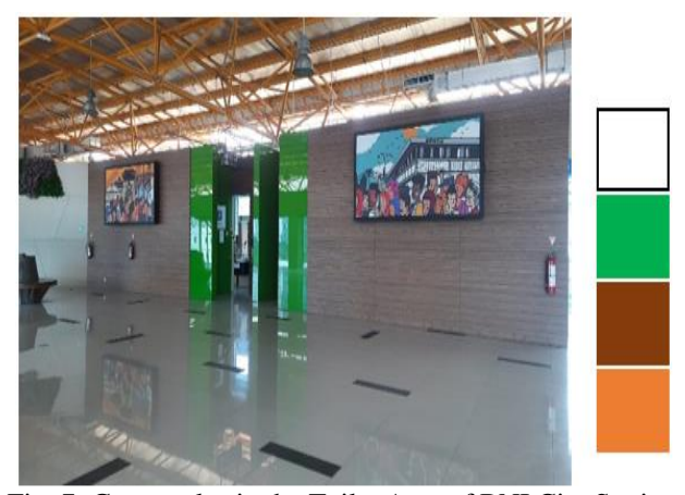
Fig. 7: Green color in the Toilet Area of BNI City Station Building