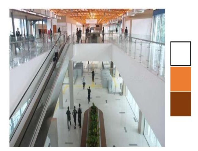
Fig. 5: White, Orange and Brown colors in the Lobby of BNI City Station

The colors used in the space in the BNI City Station building are predominantly white, combined with orange and brown colors. But on some sides of the room are found other colors. In the lobby area of the station, the floor and walls are given white to add a spacious and bright impression to the station, while the orange color on the ceiling can give a warm and comfortable feel, the brown color on the furniture can give a soft and warm impression.