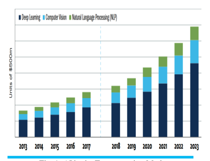
Fig. 1: AI in the Transportation Market

It is a fantastic way to raise the global economy's productivity and GDP. The statistics indicate that China and North America are the nations that will benefit the most from AI. By 2030, China's GDP will increase by 26%, while North America's GDP will increase by 14.5%, or $10.7 trillion. If we compare Canada to another nation, it contributed around $125 million in 2017 to AI research. If we compare Canada to another nation, it contributed around $125 million in 2017 to AI research. In the year 2022, the French government will invest $1.8 billion in artificial intelligence, and Russia's military will spend $12.5 million yearly [3].