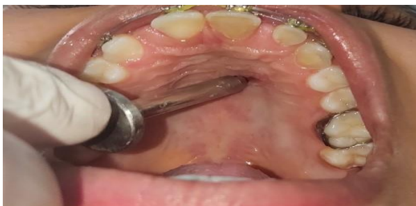
Figure 1: Placement of TAD with mini-implant screw driver.