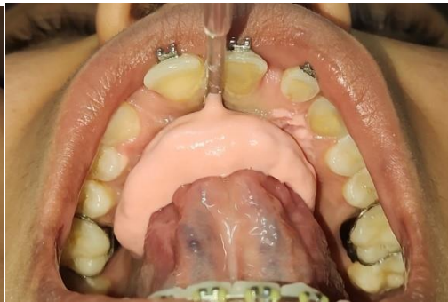
Figure 4: Recording the new, ideal Tongue position.