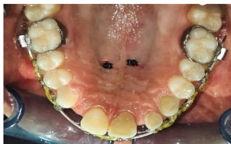
Figure 2: TADs placed in the palate.