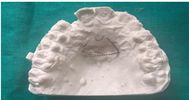
Figure 7: Butterfly shaped wire framework.