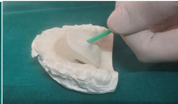
Figure 8: Tongue replica adapted over the acrylic.