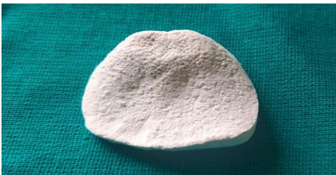
Figure 5: Working model with TADs.