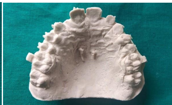
Figure 6: Replica of the anterior part of tongue.