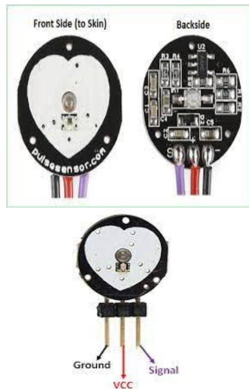
Fig. 1: Pulse sensor

the led which will help to keep away the surrounding noise from affecting the readings. When we connect a pulse sensor with Arduino or GSM Module the LED which is present on the center of the pulse sensor will be turned ON. The pulse sensor will only work when the Vcc is connected in 3v or 5v with the help of any internet connection.