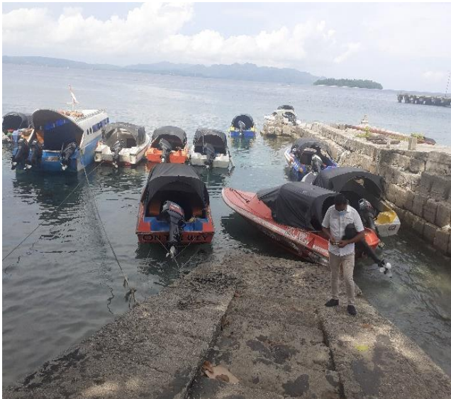
Fig 1:- Map of the distance between the sub-districts of Miangas (Indonesia) and Marawi (Philippines) and public transportation modes

Population services between islands or with an archipelagic character are distinguished from non-archipelagic population services. If population services are archipelagic in character with remote geographical conditions, difficult to reach by public transportation, and access to public services is very limited, and population services can be provided in sub-districts, while non-archipelagic population services are held at the population and civil registration office (Disdukcapil) it is centralized . (Permendagri no. 120 of 2017)