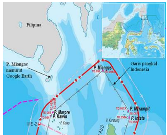
Fig 2. Map of the border between the Republic of Indonesia and the Philippines

Population services that are very far away, such as the Essang sub-district, are 75 km from the capital of the Talaud archipelago district, namely Melonguane, but the distance is using land transportation because it is one island with the capital of the Talaud archipelago district, namely Karakelang island. The inter-island population service in the border area with the Philippines is a unique public service description because it has to pass through the sea and the brunt of the waves.