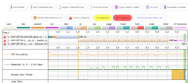
Fig 1:- The waterfall view of React Js app. [20]

Webpage.org site is used to test the performance of both the webpages through a waterfall view.