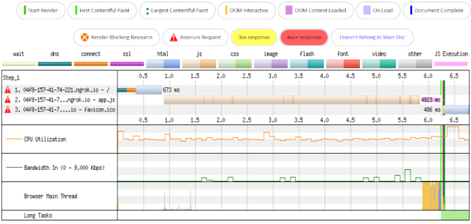
Fig 2:- The waterfall view of Vue Js app. [20]

From the figures 1 & 2, It is observed that both the web apps are very close in case of the time taken to load but in performance, Vue is preferable as the webpage is lighter in size