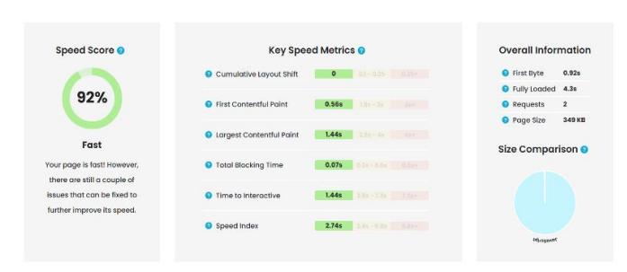
Fig 5:- Speed test of React Js app using giftofspeed.[2]

From the figures 3 & 4, It is evident that Vue Js app is slightly faster as compared to React Js app Due to half the size of React Js app.