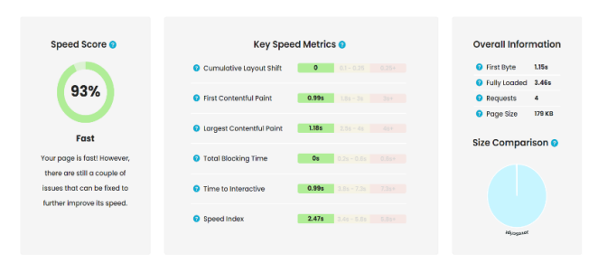
Fig 6:- Speed test of Vue Js app using giftofspeed. [2]

From Figures 5 & 6, It is evident that Vue Takes less time React but its solely due to lesser in size.