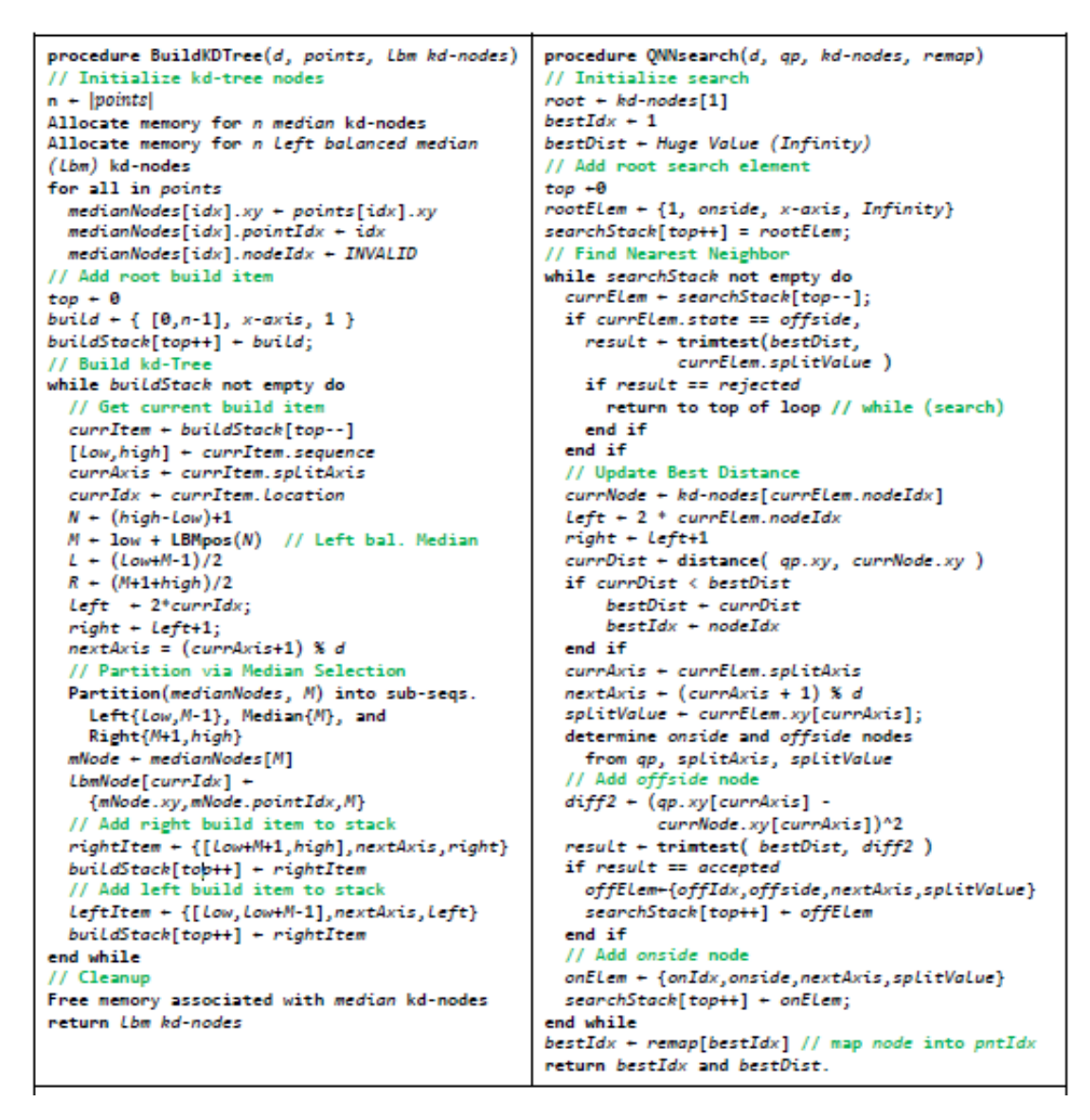
Fig 1: Build & Search Methods