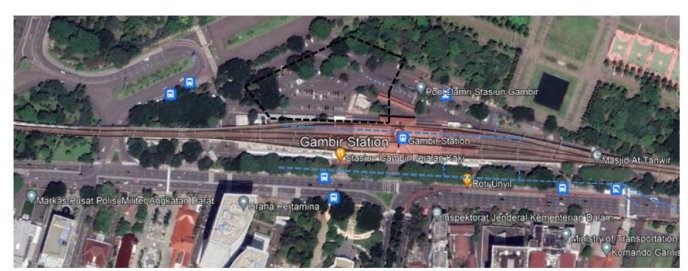
Fig 6:- The layout of Pedestrian Access and Parking Lots