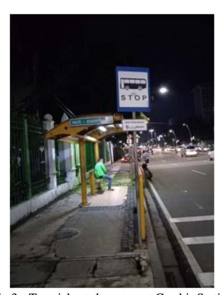
Fig 3:- Transjakarta bus stop at Gambir Station