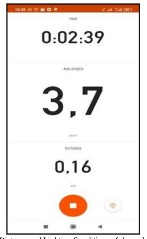
Fig 5:- Distance and Lighting Conditions of the parking area