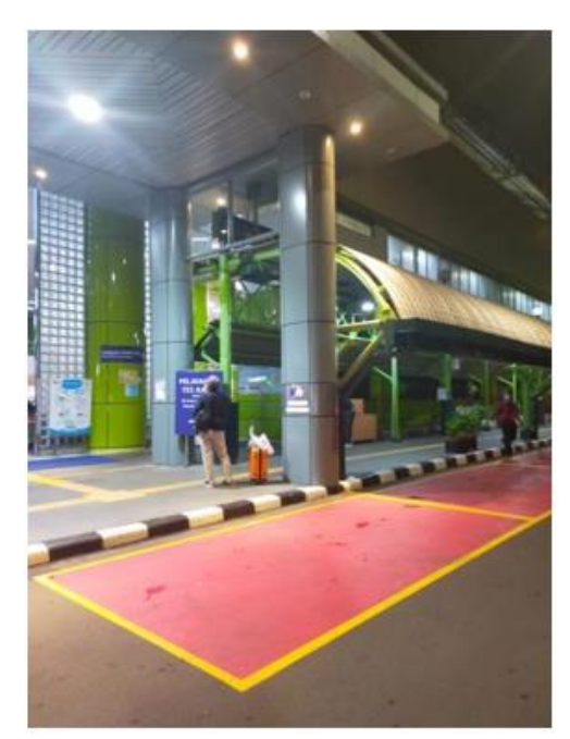
Fig 4:- Gambir Station Drop-Off Area