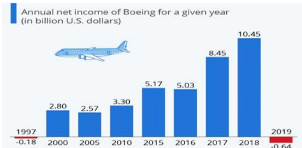
Fig 2 Boeing Annual Turnover