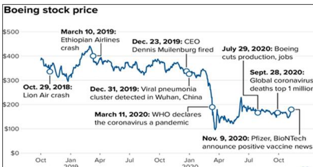
Fig 3 Boeing During Pandemic