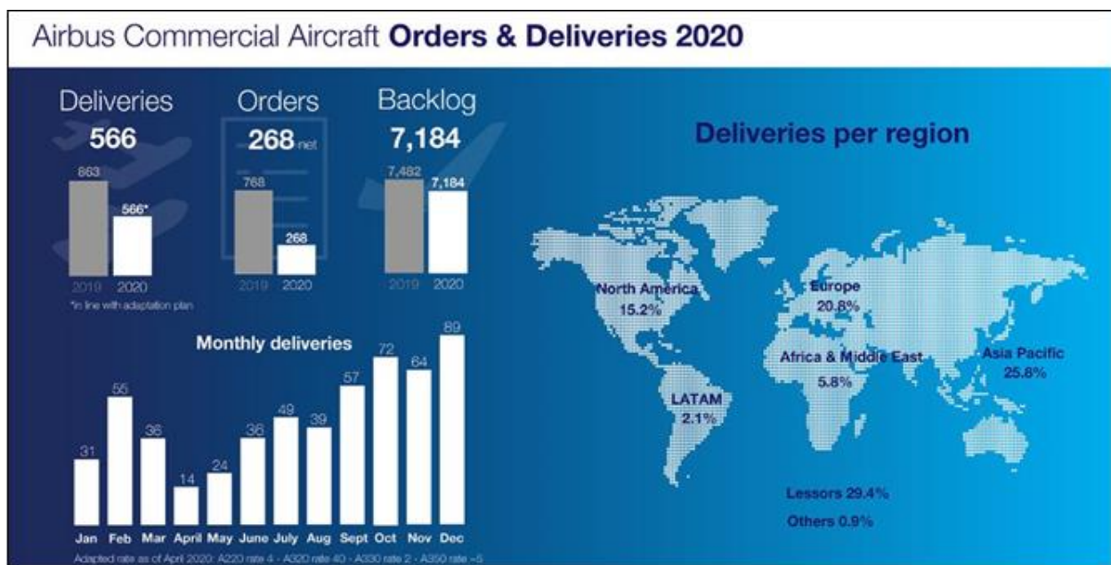
Fig 2 Airbus Commercial Aircraft Order and Delivery

In addition to these passenger aircraft, Airbus also produces military transport aircraft (such as the Airbus A400M), helicopters (such as the Airbus H125 and H225), and space systems (such as satellites and launch vehicles) [28].