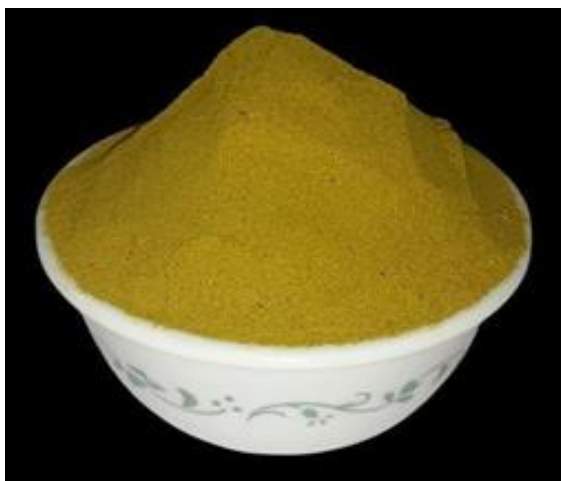
Fig 1 BAA Detox Herbal Supplement