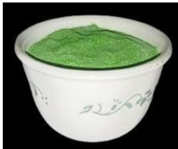
Fig 2 Chlorophyll Powder