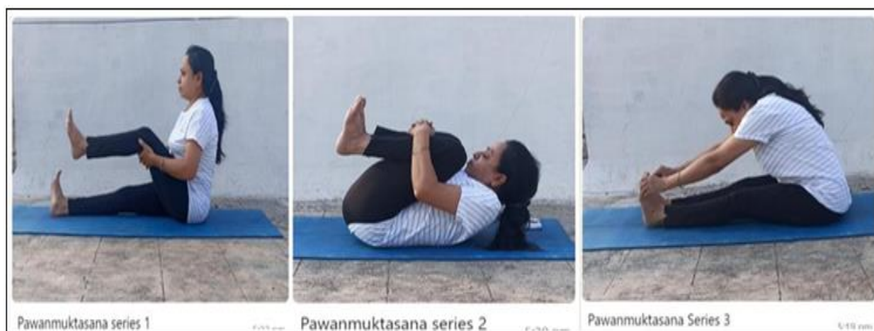
Picture 1 Yoga Poses

➤ The Picture Shows the Different Yoga Poses used in Peptic Ulcer Treatment