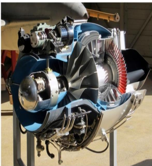
Fig. 2: Turbomeca Marboré

The Marboré turbojet is still the most widely used of Turbomeca's range of gas turbines. Designed in 1949, it was a direct scale of the company's first engine for aircraft propulsion, the 0.98 kN Piméné of 1948. It first ran in 1950, and the 2.94 kN Marboré I powered the Gêmeaux II on 16 June 1951. Marboré II Rated at 3.92 kN at 22,600 rpm. Fitted to many aircraft, notably including the Fouga Magister twin-jet trainer. The following particulars relate primarily to the Marboré VI series