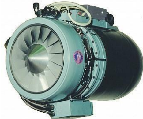
Fig. 3: Motor Sich MS-400P

This small turboprop is the first to be designed by Motor Sich which has previously mass-produced to the designs of others. It is being developed for use in small jet aircraft, especially entry-level small business jets and UAVs.