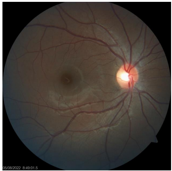
Fig. 1: OD