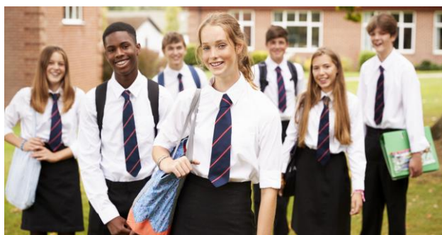
Fig1 High School

We can able to deal the things and recognize it for support kids and their thinking in Schools .Brain disorder are mostly seen and visualize during children and adult. If we detect in beginning chances of curable is Probably high because Primary detected and intervention work.