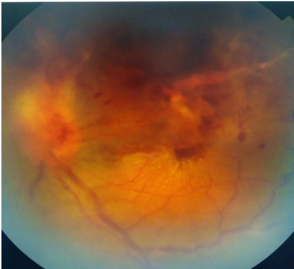
Fig 1 Fundus photographie of the left eye showing a papilledema stage 2, with perimacular exudates, retinal flames and spots hemorrhages, with cotton wool spots tortuous vessels and vasculitis.

Diagnosis and therapeutic management are urgent to preserve the anatomical and functional prognosis of the eye.