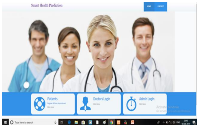
Fig. 1: Login page

user will receive an answer. When a user searches for a hospital in our system using keywords such as specialisation, doctor name, and hospital name, the user is presented with a list of hospitals that are closest to their current location.